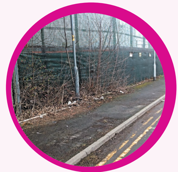
► Poorly Maintained Public Realm

"The large network of small businesses need a champion. The signage is poor, the whole area lacks identity and there is a constant 'untidiness and shabbiness' to the area"