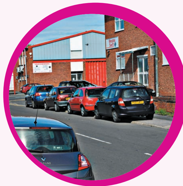
► On Road Parking