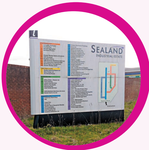
► Poorly Maintained Signage