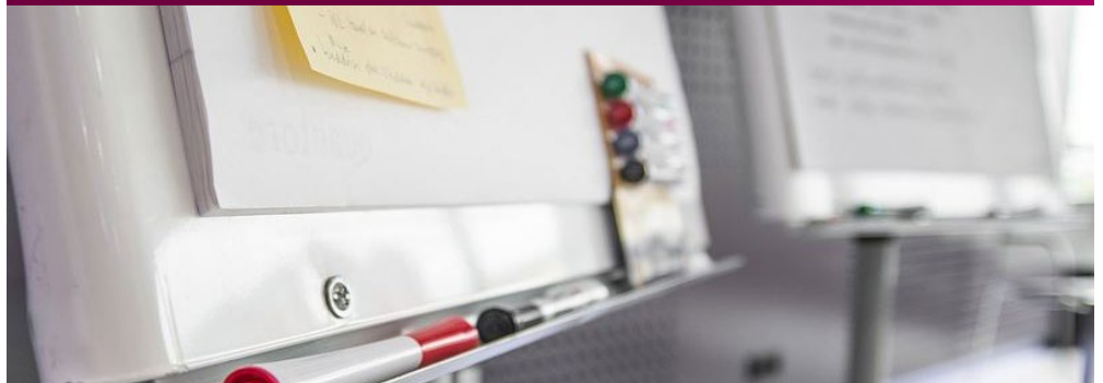
Image improvements around the business park